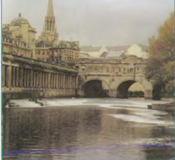
Pulteney Weir, River Avon - Bath

To ensure close contact is kept with local communities the South West Region is split into four areas - each with its own Area Manager and staff. Teams work on the ground using local knowledge and contacts to maximum effect.