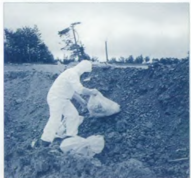
Photo: Waste emergency planning - Sussex