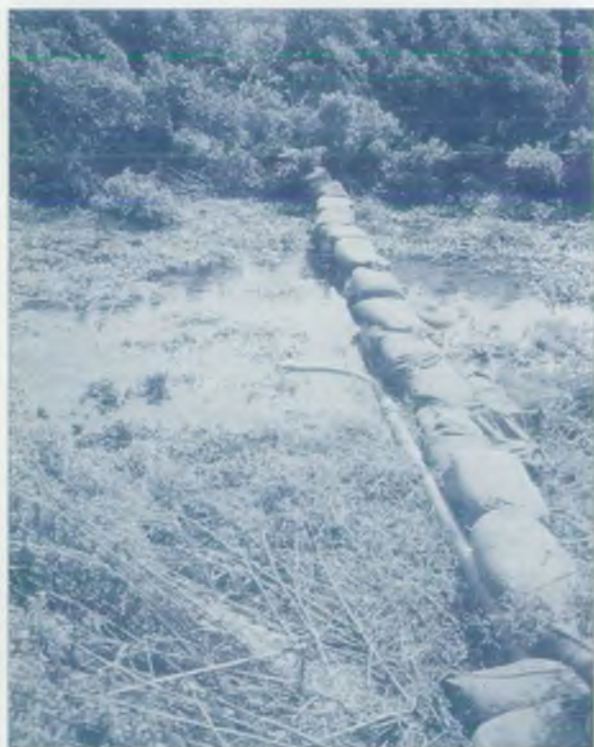
Photo: Working towards alleviating low flows on the River Darent