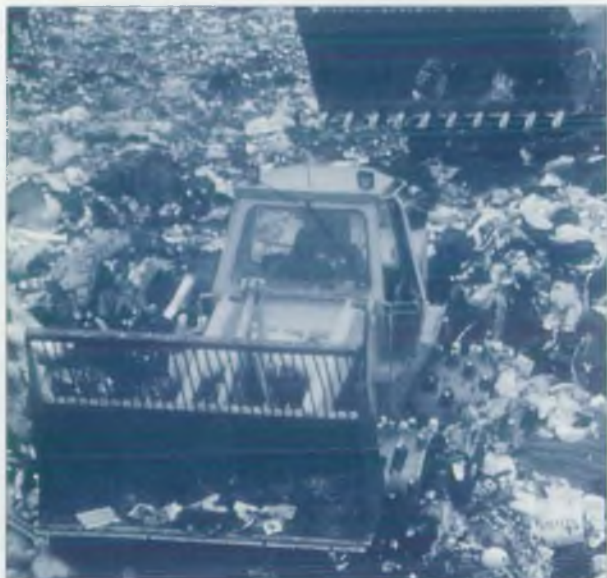
Photo: The need for waste minimisation, Kent