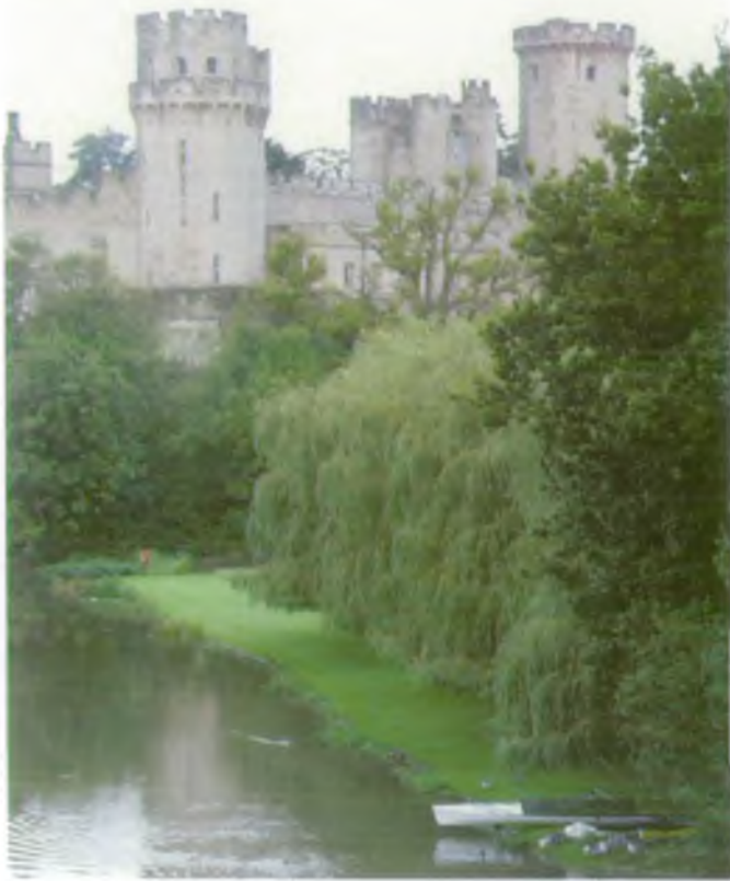
The West Midlands has a valuable water environment in need of our protection. Warwick Castle on the banks of the River Avon.