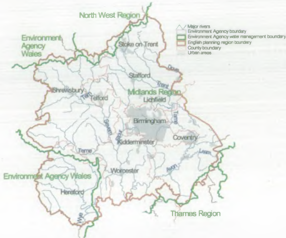
Regional boundaries in the West Midlands