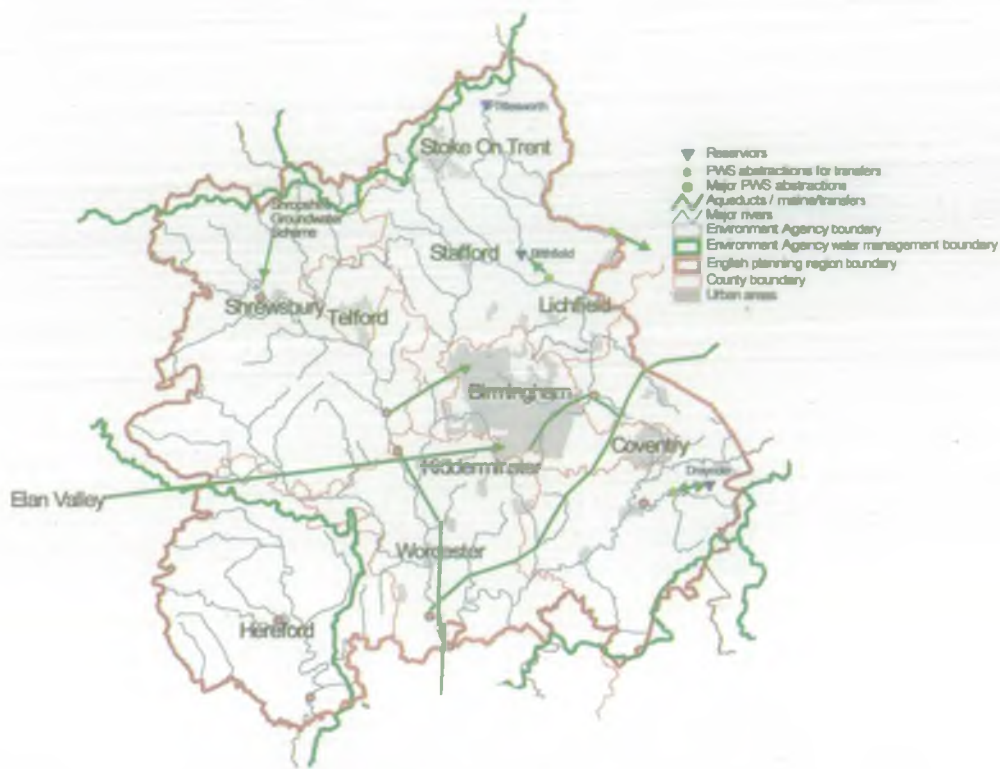
Current major transfers and water resource schemes