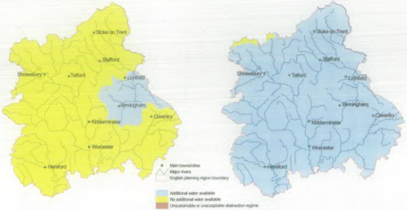
Figure 4 Current indicative availability of water resources: groundwater