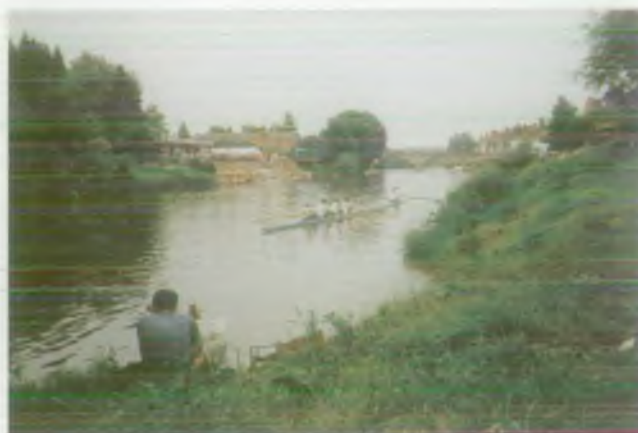
Water is a magnet for recreation and relaxation, adding to the quality of life. River Severn at Bewdley

Further information on all of our water resources activities can be found on the Environment Agency's website at www.environment-agency.gov.uk