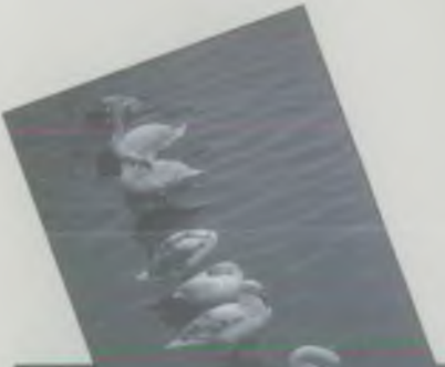
Left: City centre swans