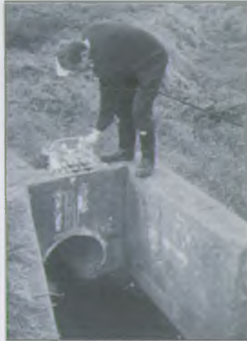
We sample streams to check for pollution

The Consultation Report describes the area and explains what environmental qualities we are trying to protect or improve. For example it identifies pollution problems; threats to water resources from quarrying in the Mendip Hills and how development puts pressure on the catchment. We also discuss how farming practices affect the water environment.