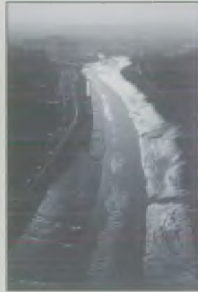
Downstream of Bristol the river is tidal