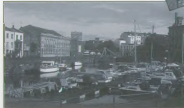
Boats in Bathurst Basin Above: Litter spoils many urban streams

It is our job to try and balance these, and many other needs and at the same time try to