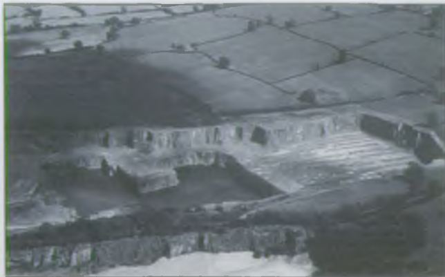
Deep limestone quarries in the Mendips can affect groundwater