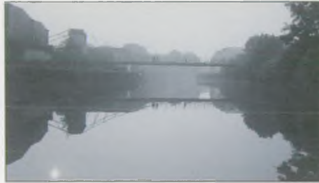
Rivers can offer peaceful open spaces in our cities

People use and appreciate rivers in different ways, for example: