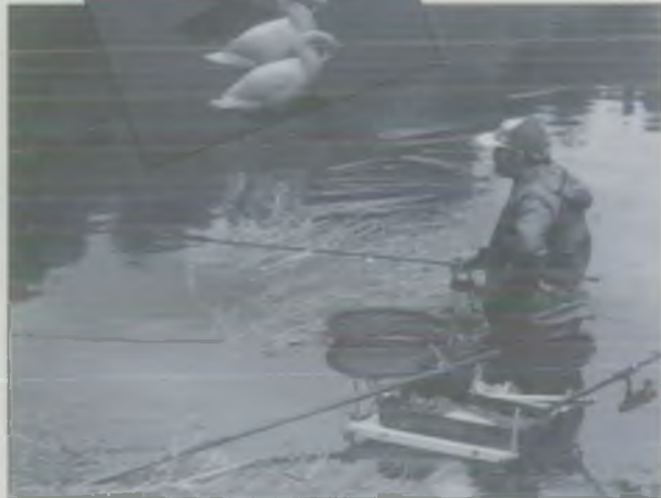
The River Avon is highly regarded as a coarse fishery