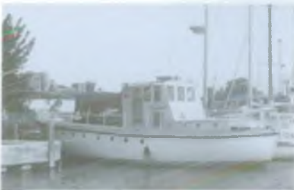
Rock Channel moorings

The original Cinque Ports were first chartered about 1155 during the reign of Henry II. Rye and Winchelsea were originally attached to Hastings but with the decline of that port, were given special status as Head Ports. The old town wall is still in existence at various parts of the town. The population in 1986 was approximately 4,600 with the main occupation being fishing and light industry.