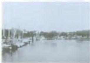
Fishing vessel moorings

Two public slipways are on standby for vessels wishing to carry out repairs, and cradles are available at private yards (max lift 20 tonnes). Details of these facilities can be obtained from the Harbour Office.