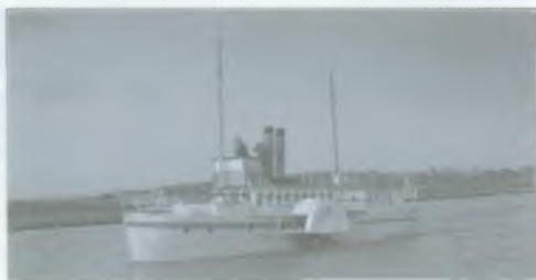
Puddle steamer leaving Rye

The entrance is 42 metres (140 feet) wide and is recognised by a conspicuous tripod beacon (Fl 5 secs Red) 30 metres seaward of the West Groyne which is 240 metres seaward of the East Pier with light post (Qk Fl. (9) 15 secs.). The channel