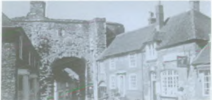
Landgate – part of the old town wall