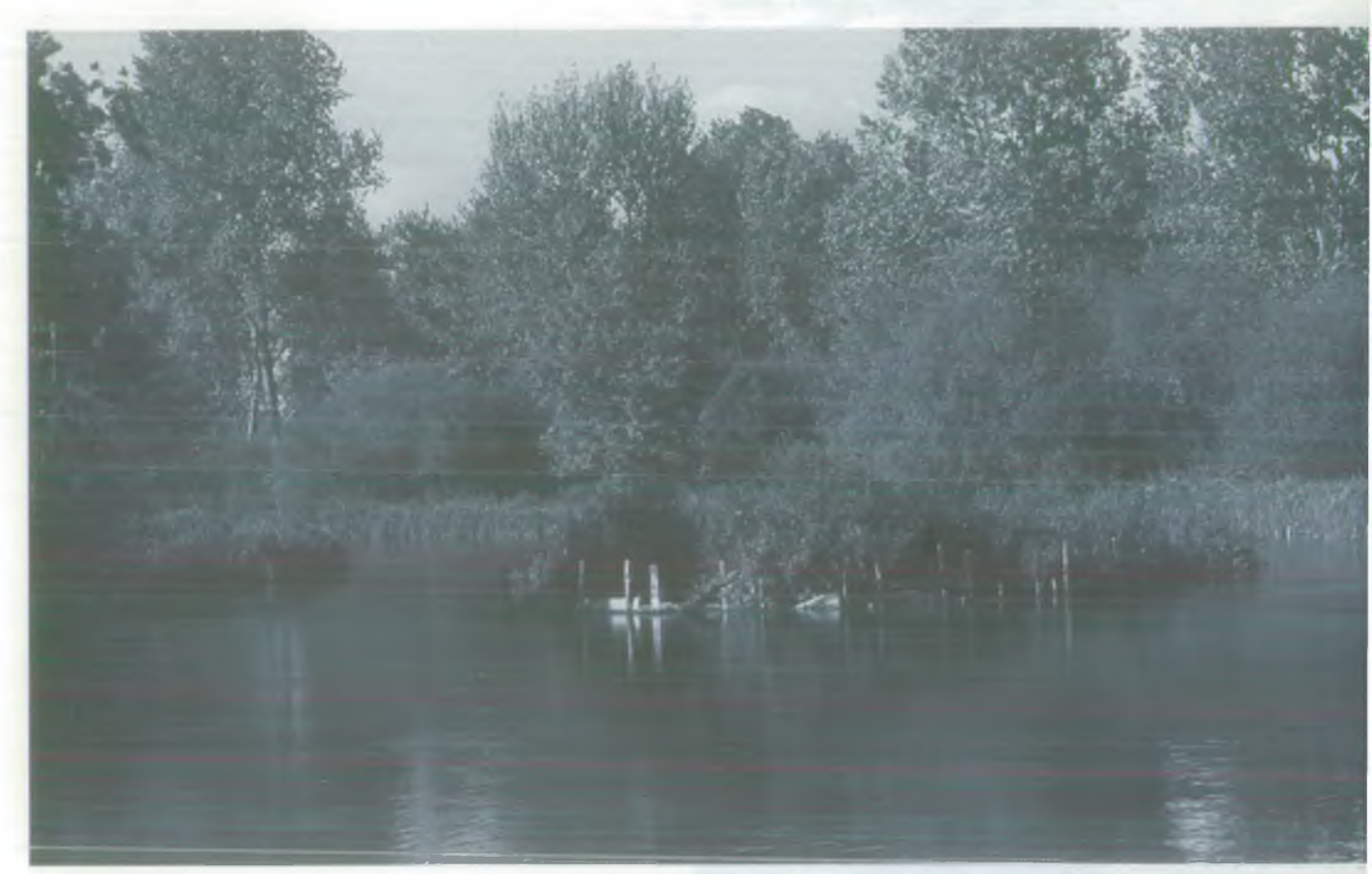
River Test, Long Porish