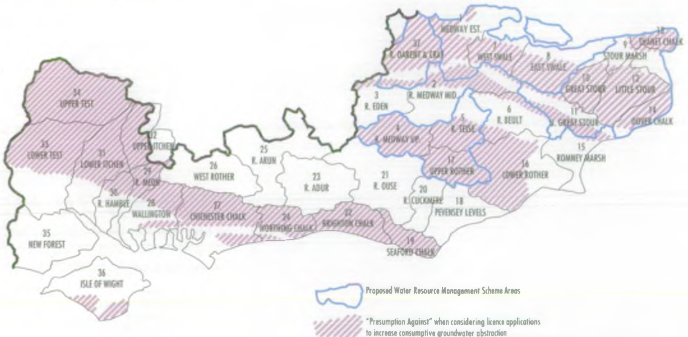
Fig.3 Groundwater Management by Resource Area