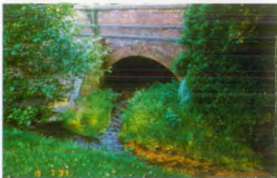
The River Waring and Thunker Drain confluence

Once the Options Development Report has been completed it will be submitted to MAFF for Agreement in Principle. Thereafter, depending on the availability of finance and priority of need, detailed design and further consultation will be carried out.