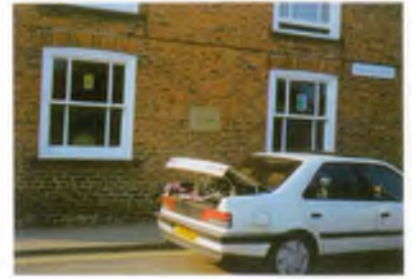
Plaque showing level of 1960 Flood

Do nothing is the baseline option common to all schemes and its purpose is to establish the damage and loss if no improvement or maintenance works are carried out.