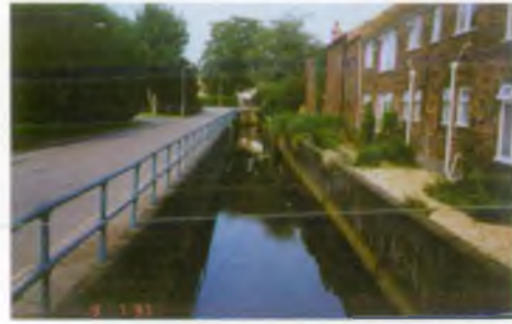
The River Waring Banks Road

Under this option the need for walls in the town centre would be reduced. However, works would still be required on the River Bain and the IDB drain by the Co-op.