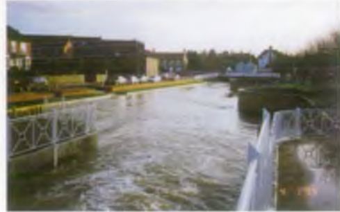
The River Bain at Watermill Road