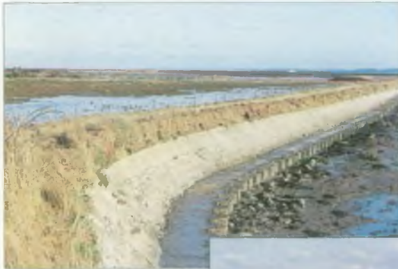
Pre Pennington Scheme