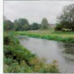
▲ The River Avon downstream of Downton