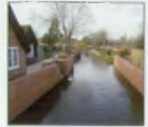
▲ The Newcourt Carrier from The Borough

The provision of the scheme may have a beneficial effect on the insurance prospects of properties. Please contact our South Wessex area office for clarification of the flood risk category for your property.