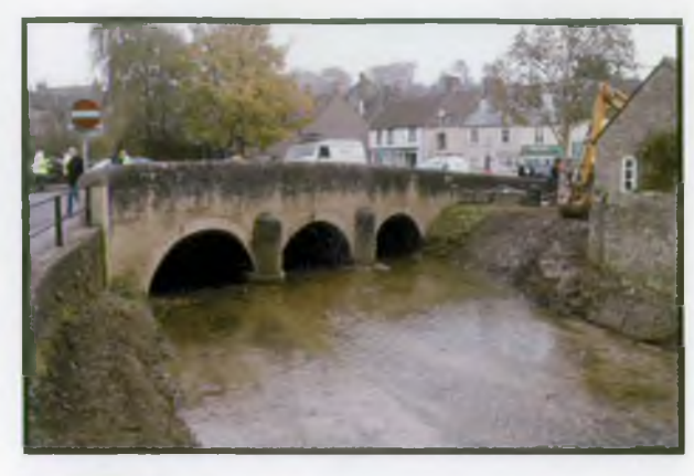
Church Bridge, Bruton