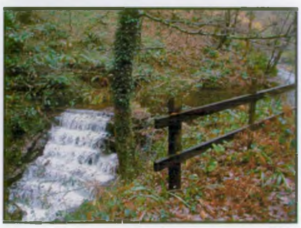
Hawkcombe Stream lower shingle trap