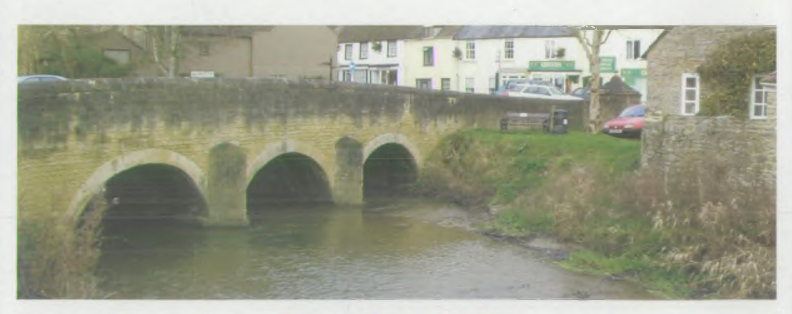
River Brue at Bruton, where we plan to develop a flood management strategy

We want public authorities and local communities to understand future changes in flood risk and for us all to work together to manage and minimise flood risk. This will help reduce the effects of flooding on our communities, the economy and our environment.