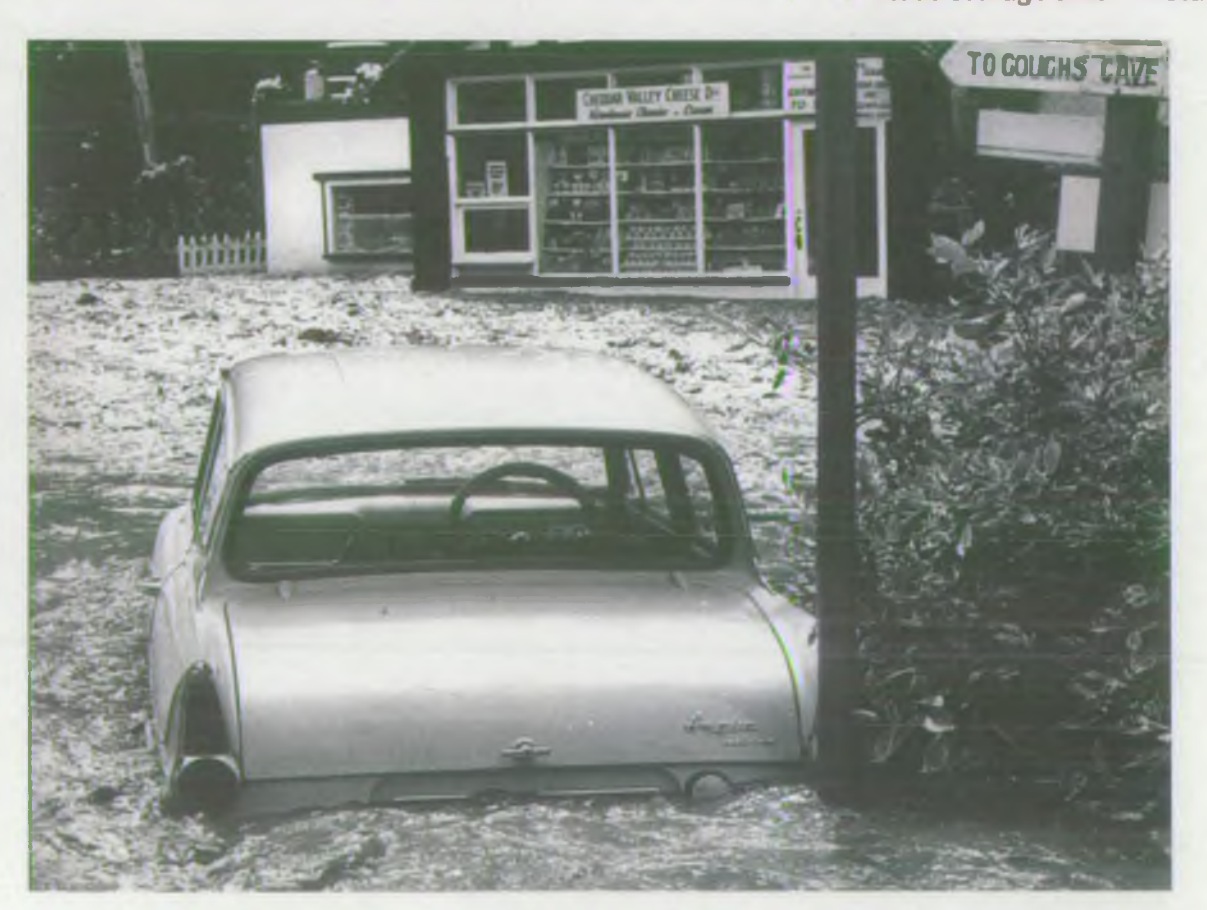
A car caught in floods pouring down Cheddar Gorge in July 1968