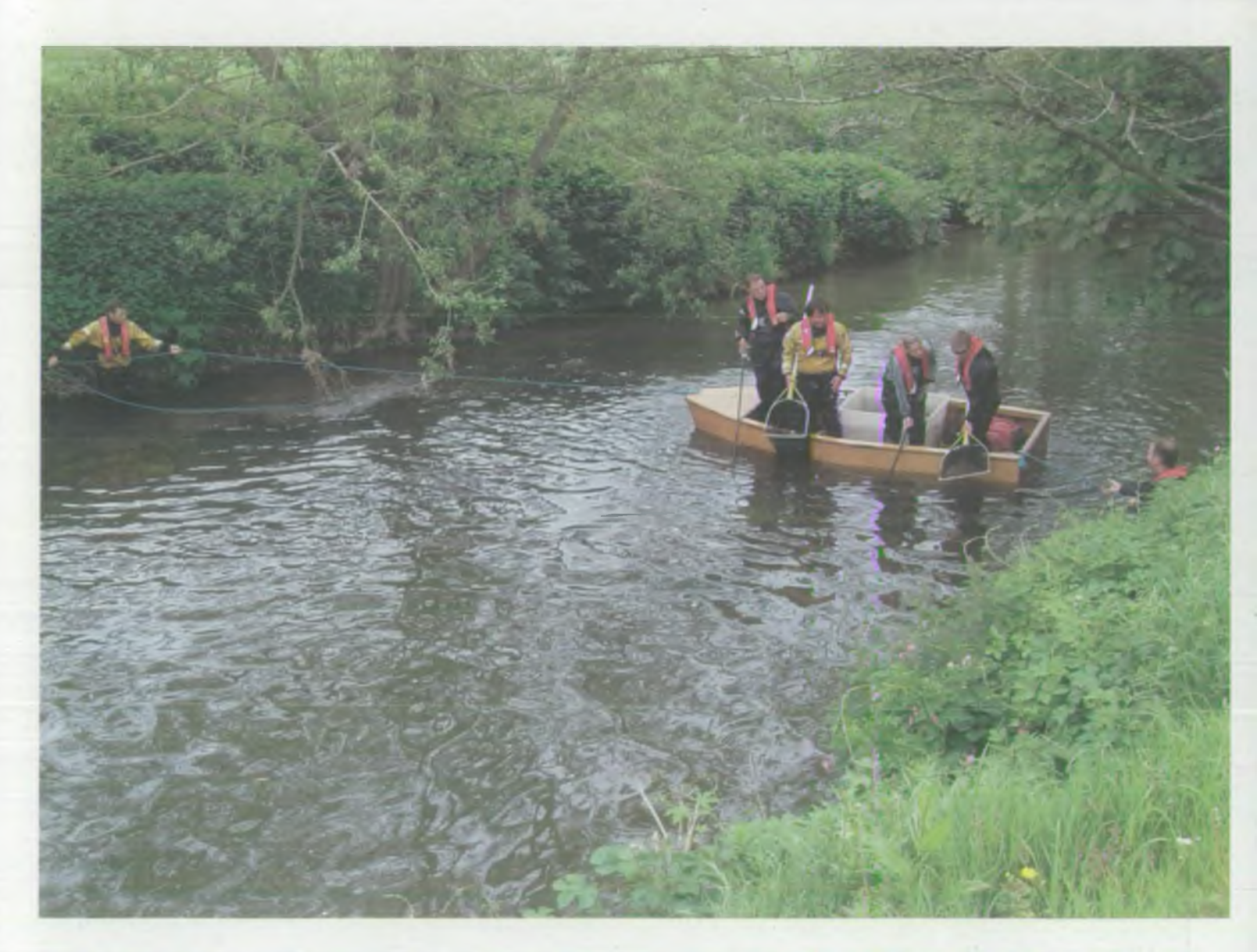
Environment Agency staff sample fish in a Somerset river: protecting habitats is one of our aims for the catchment

We outline our objectives and action plan on pages 6-7.