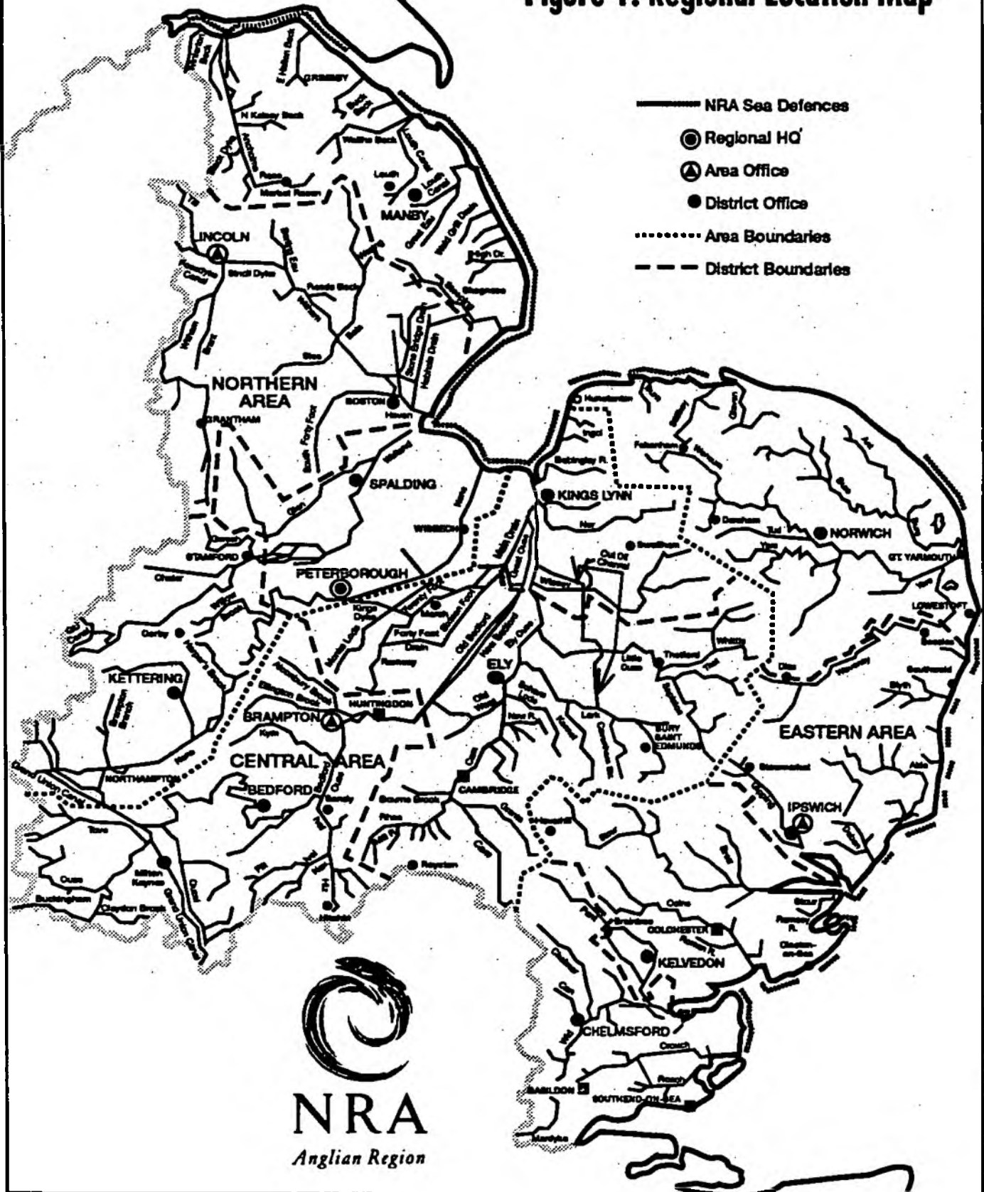
Figure 1. Regional Location Map