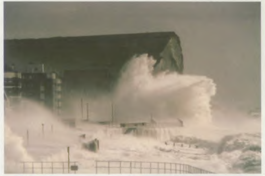
Storms prior to the original beach nourishment scheme in 1987

To establish which of the options was the most cost effective, we used benefit cost analysis. Benefits were calculated from the amount of flood damage that has been avoided based on predicted depth and frequency of flooding. The costs used are the predicted construction and maintenance costs of the proposed options.