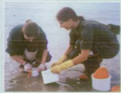
Two members of the Environment Protection team testing samples on the beach

There's a lot to do in the local area – Southampton has some great shops! The New Forest is nearby for cycling and walking. It's only an hour and a half to London, so you can visit easily and not have to live there! There's the port at Portsmouth, so the Isle of Wight and France are easily accessible. Oh and there's the lovely Southern sunshine!