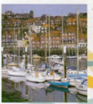
River Esk, Whitby