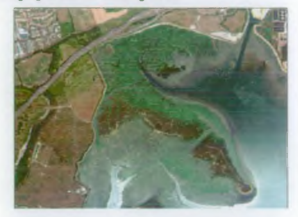
CASI image of Langstone Harbour showing areas covered by green algae.

and associated problems such as lack of available foraging areas for wading birds.