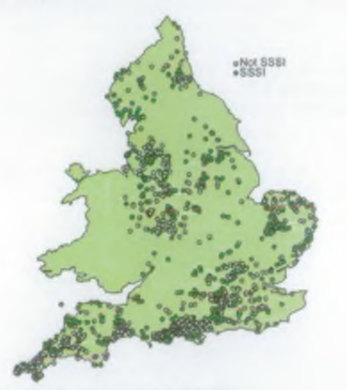
Location of lowland heathland in England

3.7 Lowland heath is a scarce habitat which supports a wide range of rare plants and animals. In England only one sixth of the heathland present in 1800 now remains. Fragmentation and disturbance from developments such as housing and road constructions are some of the factors affecting the habitat at present.