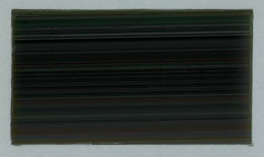
INTERNAL AUDIT REPORT