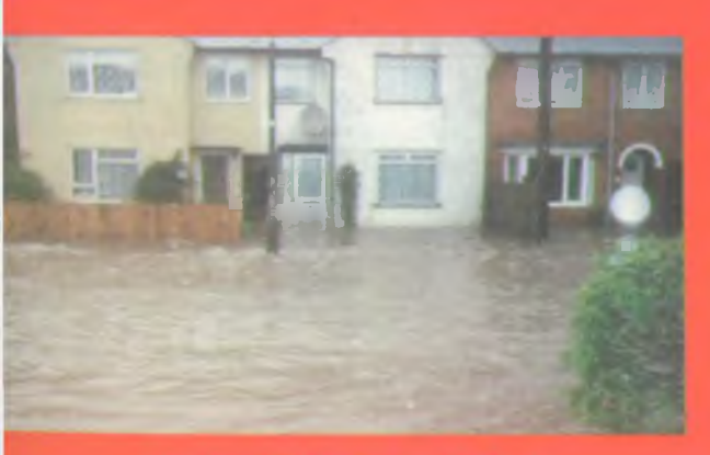
Flooding of Middlemore Road, Northfield

Once the gauge has been calibrated, residents within the risk area will be invited to join the flood warning service, nominating telephone numbers for contacting them when a flood is anticipated.