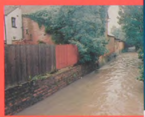
River Rea. Northfield

The main development area within the Tame area has been the installation of a river gauge within the MG Rover plant at Longbridge. This will provide early warning to the residents of Northfield who have suffered flooding four times in the past two years. The River Rea reacts quickly to rainfall which is of short duration and high intensity.