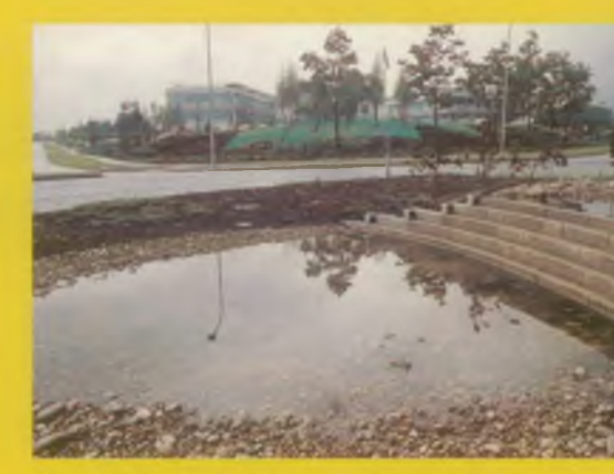
Blythe Valley Park, Solihull

Good progress has been made with the implementation of SuDS at various sites across the catchment. The Newhall Valley site is now used as a flagship for others. The main issues for SuDS to overcome are those of adoption (who's going to look after them), maintenance (how is long-term maintenance insured), ground conditions and awareness. The Agency will be focusing on forming strong partnerships with those that will be potentially involved with SuDS schemes and providing information to those who require it.