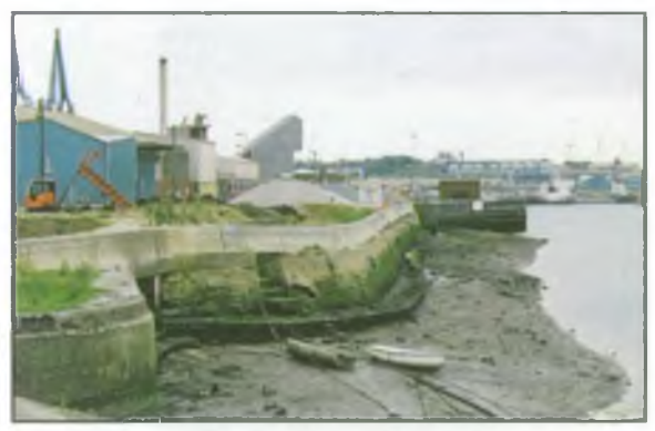
Failed defence at Velocity Control Structure

The Environment Agency are responsible for flood defences in Ipswich. The Government encourages operating bodies such as the Environment Agency to consider flood defence in an integrated and sustainable way by looking at the whole river system rather than individual sections. A long-term plan, known as a flood defence management strategy, is developed and sets out the policy and objectives for flood defence taking into account a broad range of local interests and issues. Within this framework we can make decisions about providing the most appropriate flood defences and this approach allows us to manage the whole flood defence system more effectively.