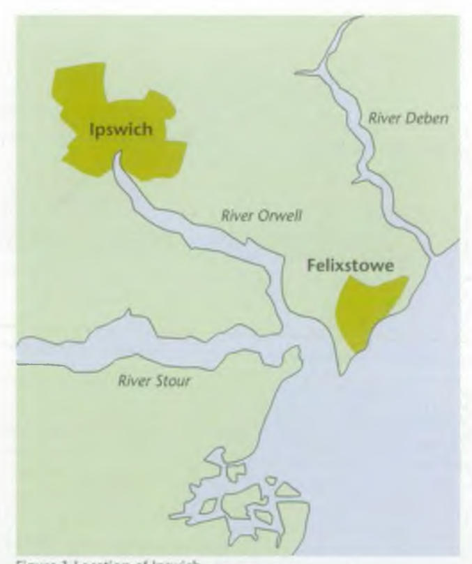
Figure 1 Location of Ipswich

Ipswich is situated in Suffolk where the Rivers Orwell and Gipping meet (Figure 1). The rivers run through the centre of the town, through industrial and residential areas and the port. Our study area extends from Norwich Railway Line Bridge downstream to the Orwell Bridge, where the estuary widens. A map of the study area is shown on page 3.